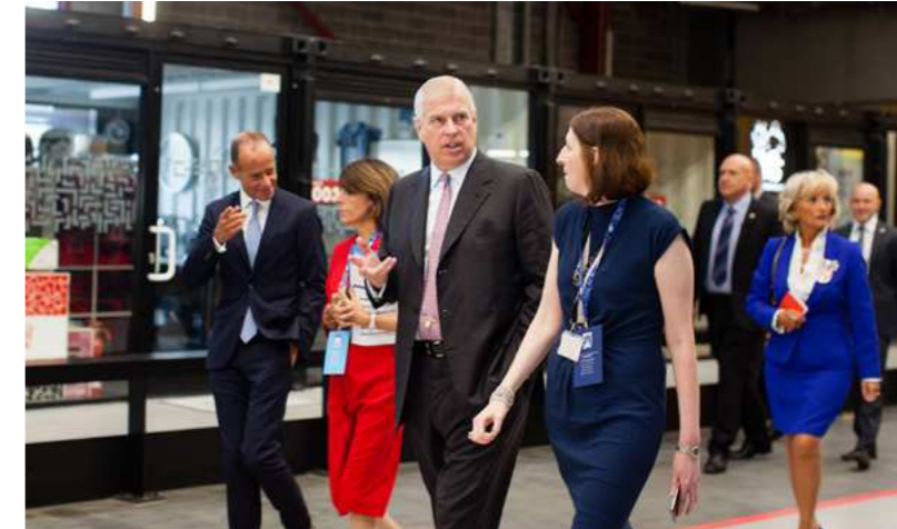
Pitch @ Palace, September 2015 supported by SharpFutures